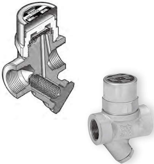
Capacity Chart S55N, S55H